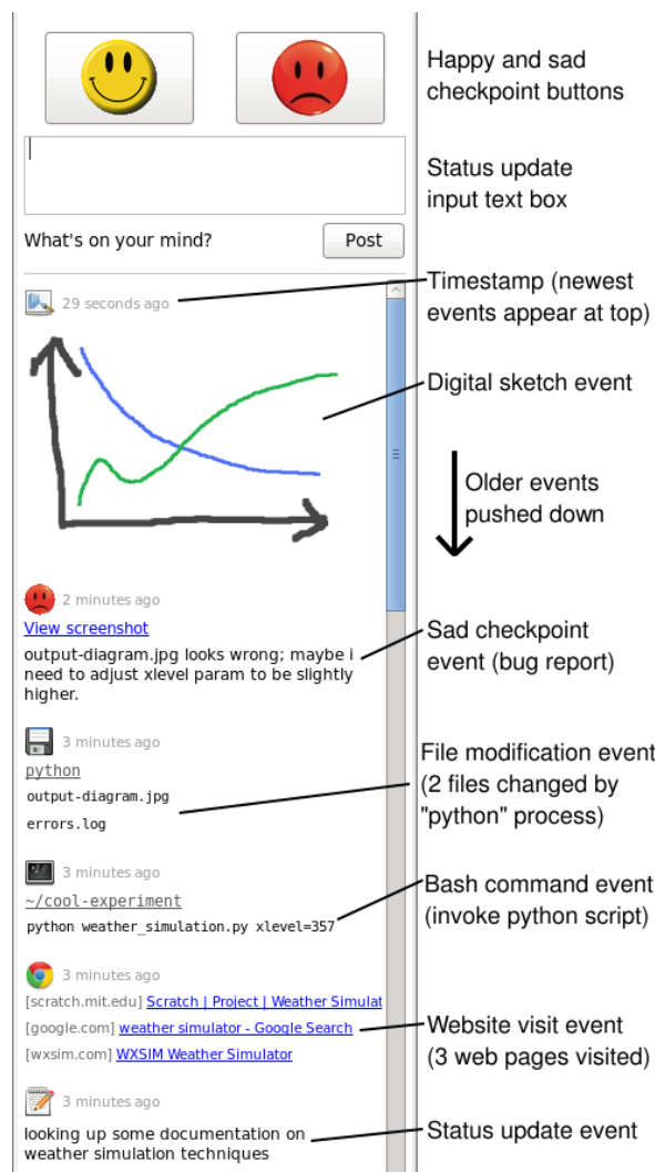
Figure 2: The Activity Feed resides on the desktop background and shows a near real-time stream of user actions.