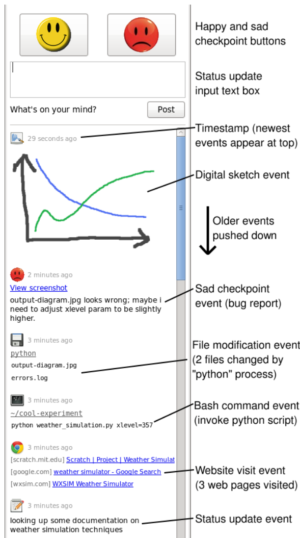
Figure 2: The Activity Feed resides on the desktop background and shows a near real-time stream of user actions.